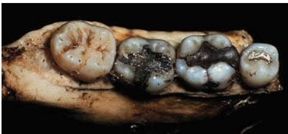
Teeth photographed from unidentified male; right side, lower mandible including one premolar and three molars.