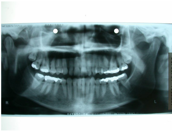
Panoramic x-ray of Richard Boyce showing all teeth, dated April 22nd, 2001.