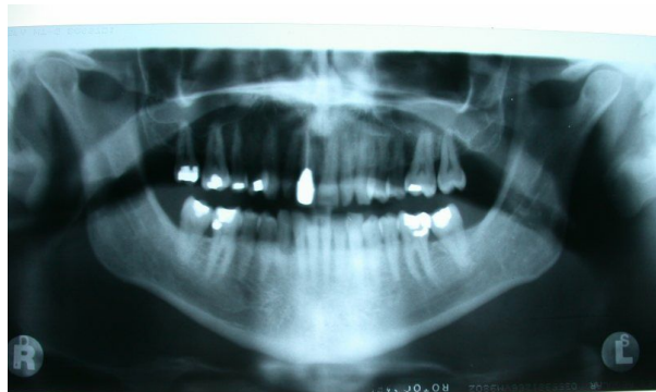
Panoramic x-ray of Jack Straw showing all teeth, dated January 8th, 2002.