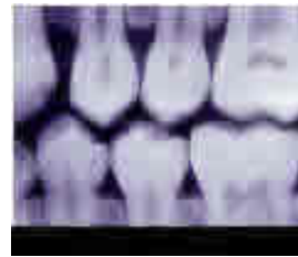
Bite wing obtained from Elaine Staw's dental records showing left side of mouth, dated August 20th 1999.