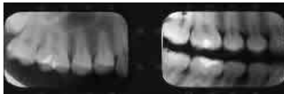
Bite wings obtained from dental records of Mike Boyce, showing top left side and right side of mouth respectively, dated March 15th, 2001.