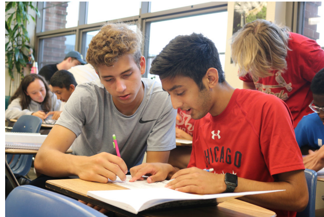
Proposition E will be used to maintain and strengthen the District's academic excellence and fiscal stability by eliminating the gap between revenues and expenses, addressing facility and maintenance needs and rebuilding reserves.

last for three years. It has lasted for more than 15. School districts do not have the means to increase