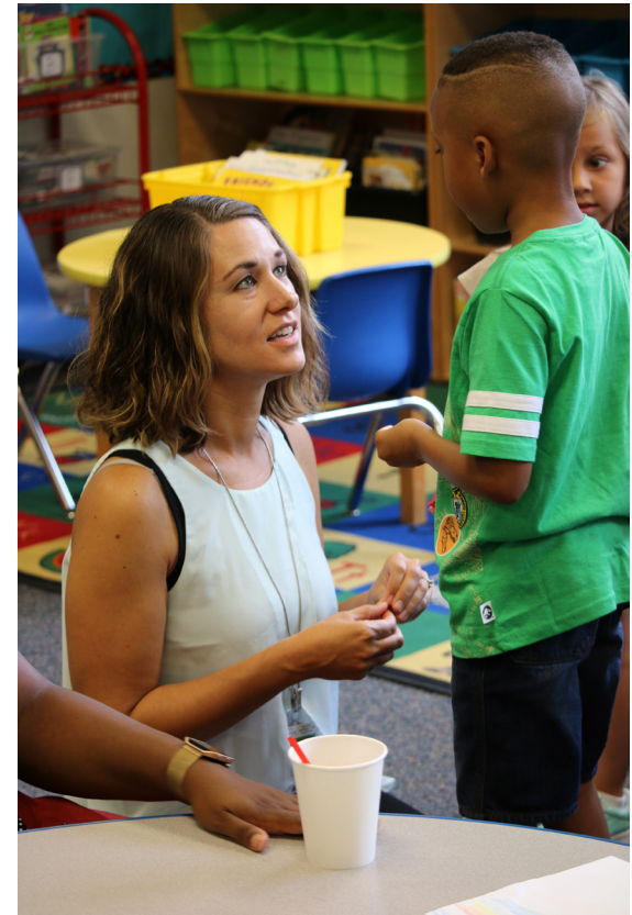
The District's last operating levy increase was approved by voters in 2003 and was expected to last for three years. Due to sound fiscal management, it has lasted for more than 15.

Visit claytonschools.net/PropE to learn more.