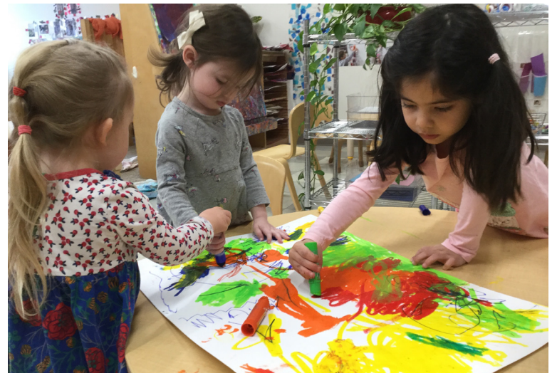
The additional revenue from Proposition E would be used to maintain and strengthen the District's academic excellence and fiscal stability.

The amount of the requested increase was developed after nine months of listening to the community and gathering critical feedback, including conducting input sessions last March, hosting FOCUS Open Houses in November and meeting with advisory groups in December. It was determined based on the need to close the gap between projected revenues and expenses, rebuild reserves and provide funds to address maintenance and facility needs while also maintaining academic excellence and programming and continuing to meet community expectations for our schools. The proposal for a 56-cent operating levy increase and eight-cent Proposition C waiver will provide funding to maintain programs and facilities while ensuring the District's fiscal health for at least the next five years.